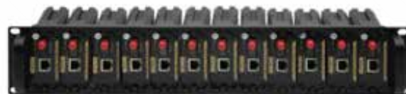
DV212 with media converters mounted